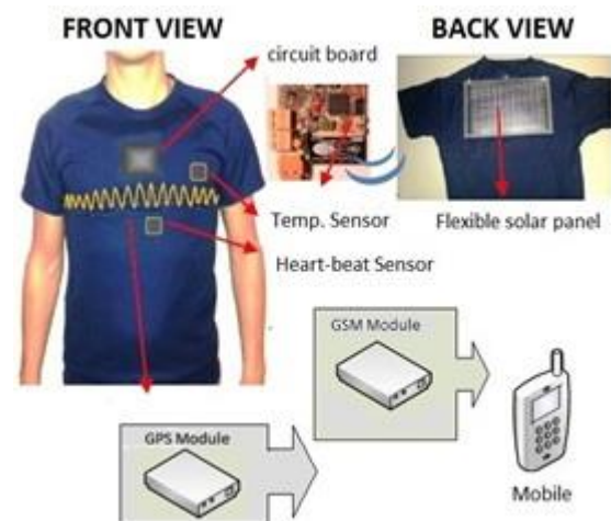
Fig -1: Wearable System Architecture.