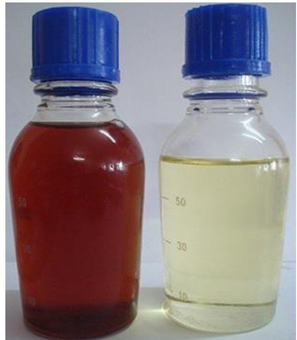
Fig -3: Transformer Oil Before and After Filtration

Two nitrile rubber hoses with flanged end connection on both sides are provided, one for oil inlet & one for oil outlet. They are capable of handling the transformer oil at 100 Degrees Celsius (maximum) and vacuum.