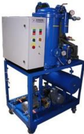
Fig - 1: High Vacuum Transformer Oil Filtration Machine

Fig. – 1 shows the high vacuum transformer oil filtration machine. Transformer oil filtration machines are available in various ratings starting from 100 LPH (liters per hour) to 16,000 LPH. The filtration machine is either stationary type or mobile type. The screw jacks are provided for relieving pressure on wheels at stationary conditions. It is weather proofed and suitable for outdoor use. The equipment is enclosed and protected against climatic conditions. All the components have adequate strength and rigidity to withstand the normal conditions of handling transport and usage. The plant is suitable for operation on 415 volts, three phase, 4 wire, 50 Hz, A.C. Supply.