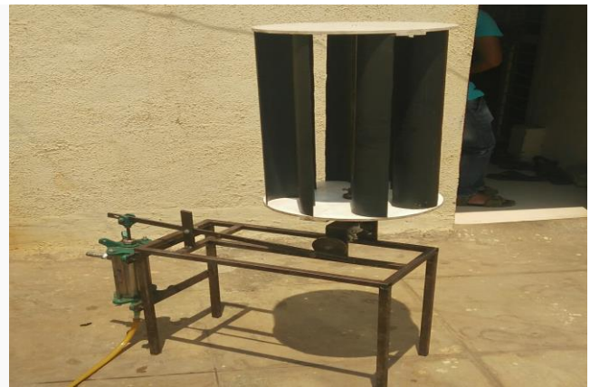
Fig -2: Project setup