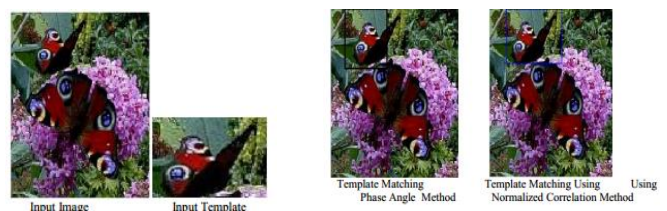
Figure 3: Template matching [3]

Bruneli and Poggio they are provides four template features are eyes,nose,mouth,face .in which compare results with graphical based Algorithm. Eigen face templates is easy to understand , it is low costly than other classifiers. Template Matching is expensive technique.