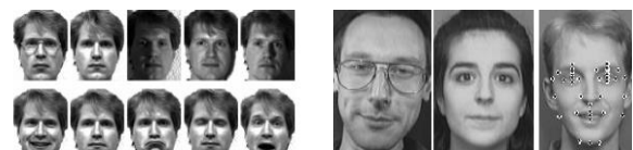
Figure 4.Face recognition using fisherfaces technique[9] Figure 5: Geometric based recognition [10] In Fisherfaces technique are used for face recognition described by Belhumeur et a works on both principal component analysis and linear discriminant analysis which creates a subspace projection matrix, near with used in the eigenfaces technique, yet the

Fisherfaces is the mostly successfully used Technique for face recognition. It is work on appearance based method. In which used LDA to detect set of beginning images which has maximizes the ratio of class scatter and within class scatter. The demerits of LDA the class the scatter matrix is always single value, but the number of pixels value in images is bigger than the number of images so that is the reason of increase detection of error rate if there is a change in position and lighting condition within same images. overcome this problem many algorithms are suggested. Because the fisherface technique works on the merit of within-class information so it minimizes the change within class. Problem are related with change in the same images in lighting changes can be control .