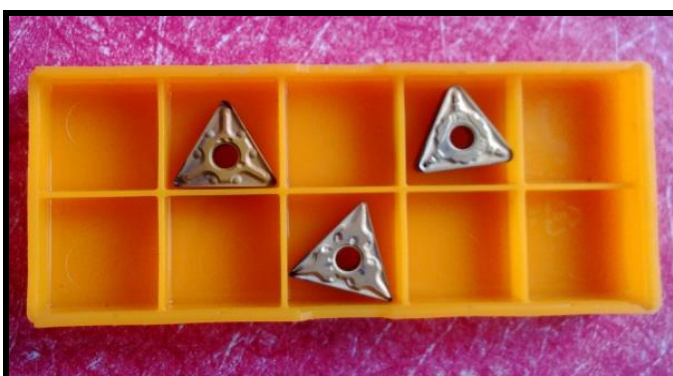
Table -4.1.1: Insert specification.