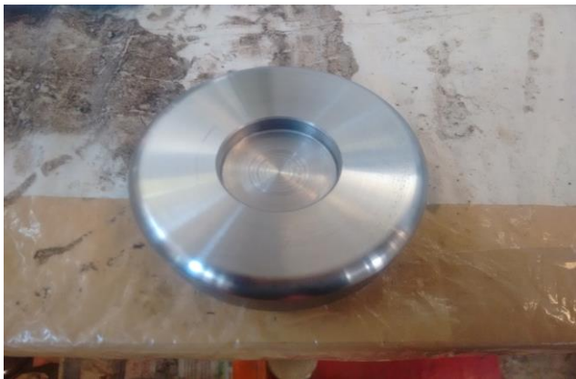
Fig -4.1: Pressure cup