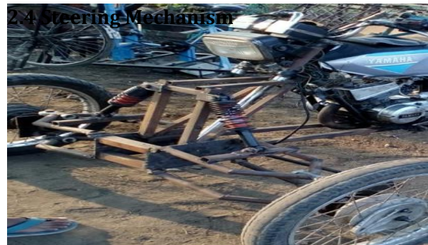
Fig-4: Steering Mechanism

Power from engine is transmitted to the one of the rear wheel of the vehicle with help of chain and sprocket mechanism, universal coupling, bearing with bearing hub the power from engine is transmit from engine shaft to the sprocket mechanism with help of chain then sprocket mechanism connected to the universal coupling due to this direction of power transmission is change. In this way power is transmitted engine shaft to the one of the rear wheel.