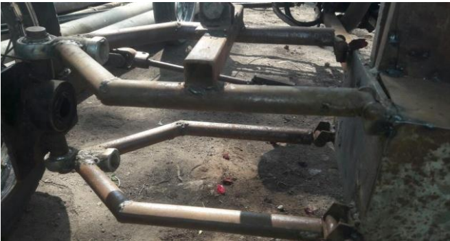
Fig-1: Front swing

Front swing consist of round pipe square pipe, MS plate, end bearing, hinges and bearing with bearing hub. The function of front swing used to give the flexibility in vertical as well as horizontal direction the hinges and end plane bearing very important role in swing