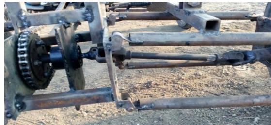
Fig-3: Power Transmission system