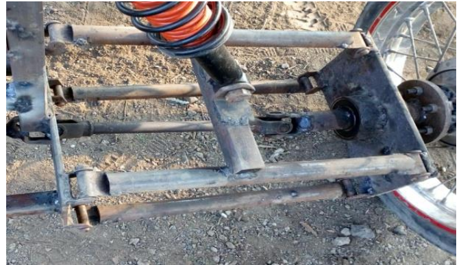
Fig-2: Rear swing