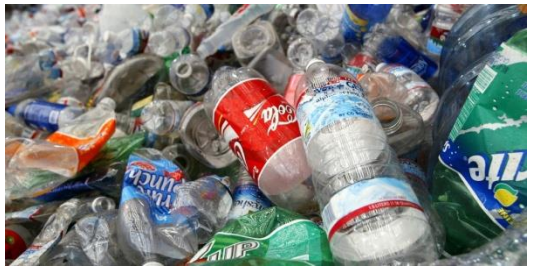
Figure 3.1: WASTE BOTTLE PLASTIC

Polymers are chemically inert large molecules made up of repeating chemical units (monomers) that bind together to form long chains or polymers (Crawford 2007, EC 2011). Polymers are pure materials formed by the process of polymerisation, though cannot be used on their own, but additives are added to form plastics (Crawford 2007). These additives include: antistatic agents, coupling agents, fillers, flame retardants, lubricants, pigments, plasticisers, reinforcements, and stabilisers (Harper 2006). Pure polymer may include silk, bitumen, wool, shellac, leather, rubber, wood, cotton and cellulose (Crawford 2007, Stephen 2009).