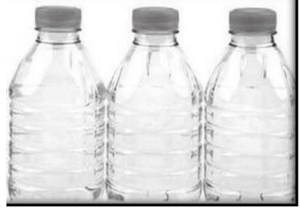
Figure 3.3 WATER BOTTLES

Plastic waste strips of the type of Polyethylene Terephthalate (PET) were used as a reinforcing material in the black cotton soil for the present investigation. These were obtained from Kaytech factory located in Atlantis, The PET waste bottle plastic strips were of assorted colours and their sizes ranged between less than 5mm to greater than 1.18mm. The physical properties of the waste plastic strips.