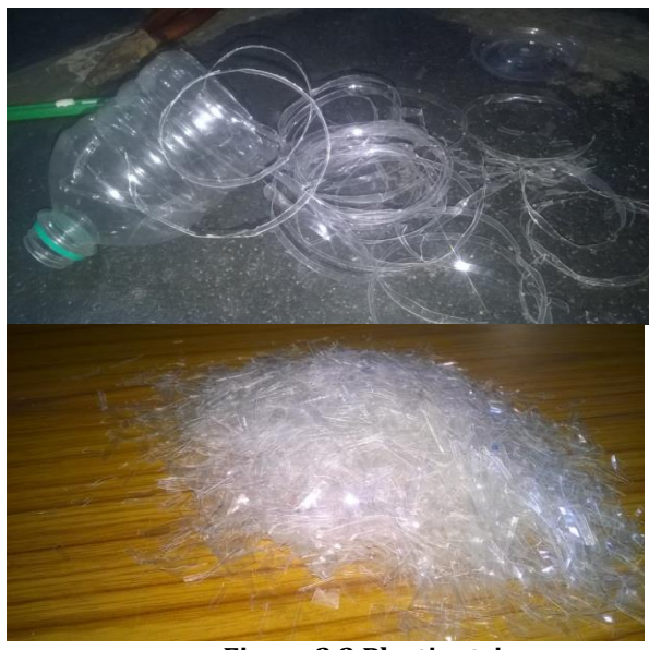
Figure 3.3 Plastic strips

Plastic waste strips of the type of Polyethylene Terephthalate (PET) were used as a reinforcing material in the black cotton soil for the present investigation. These were obtained from Kaytech factory located in Atlantis, The PET waste bottle plastic strips were of assorted colours and their sizes ranged between less than 5mm to greater than 1.18mm. The physical properties of the waste plastic strips.