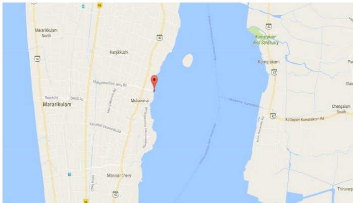
Fig -1: Map of the Muhamma-Kumarakom Region

Kumarakom is one of the major tourism attraction in Alappuzha district. Tourism in Kumarakom largely revolves around the backwaters of the Vembanad Lake. Kumarakom has been declared a Special Tourism Zone by the Kerala state Government, as legislated for by Kerala tourism Act, 2005.