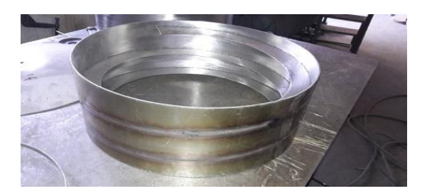
Fig -2: Cylindrical Bowl

Cylindrical bowls provide a constant feed of components. They are ideal for small components. Materials that can be used in cylindrical bowl are stainless steel, aluminum and steel.