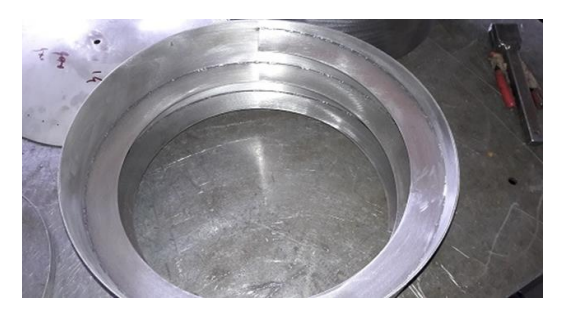
Fig -3: Feed Track

Powered - Vibration to move parts toward work head.