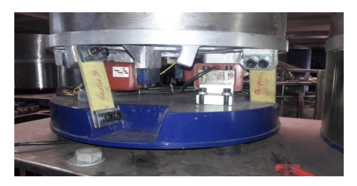
Fig -5: Drive Unit And Base Plate