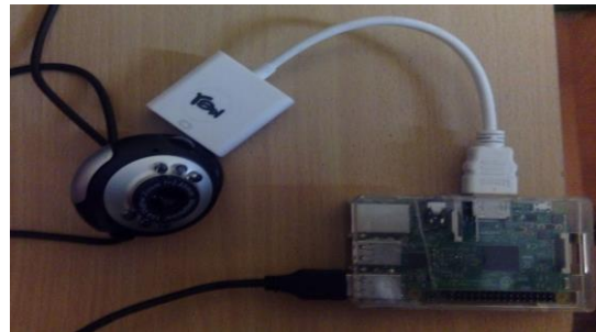
Fig.3 Hardware module

Thus the text can be spotted by using neuro OCR and is renewed to audio. However due to the less steadfastness of the webcam, the output obtained is not 100% truthful. The accuracy can be improved by building use of a HD camera or mobile camera. Figure 5 shows the output of the tesseract OCR device. Figure.6 indicates the harvest of the spell corrector to correct the misspelled words from the OCR.