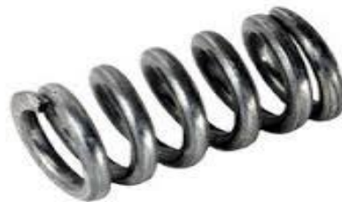
Fig -1: Mechanical spring

Springs are mechanical elements that exert forces or torques and absorb energy. The stored absorbed energy is released later. Springs are made up of metal. Metal springs can be replaced by plastic springs in case of light loads. Structural composite materials are used by some applications which require minimum spring mass. Blocks of rubber can be used as springs, in bumpers and vibration mountings of electric or combustion motors. Figure 1 shows mechanical spring.