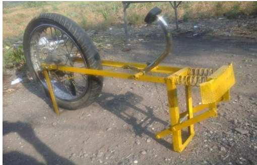
Fig -2: Construction of project

in front of vehicle then it compresses the spring loaded flexible bumper first and take some time to reach the actual chassis of vehicle. During this time interval, flexible bumper rod drags the brake and clutch pedal by means of spring and it actuate clutch and brake of the vehicle.