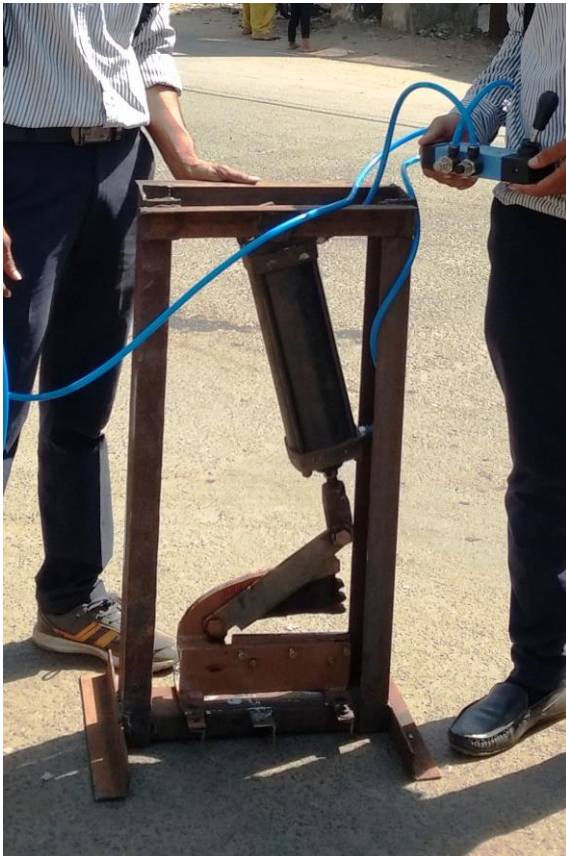
Fig-1: ACTUAL MODEL OF PNEUMATIC SHEET METAL CUTTING AND BENDING MACHINE