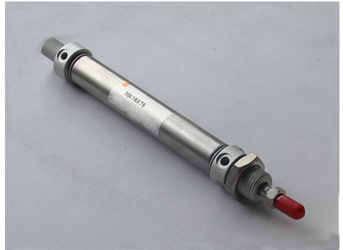
Fig. Double acting pneumatic cylinder

strokes. The air from the compressor is passed through the solenoid valve which controls the pressure to the required amount by adjusting its knob.