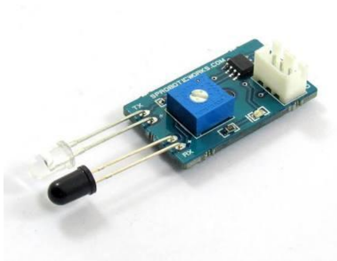
Fig. IR Sensors

This unit consists of two components : IR Receiver and IR Transmitter.