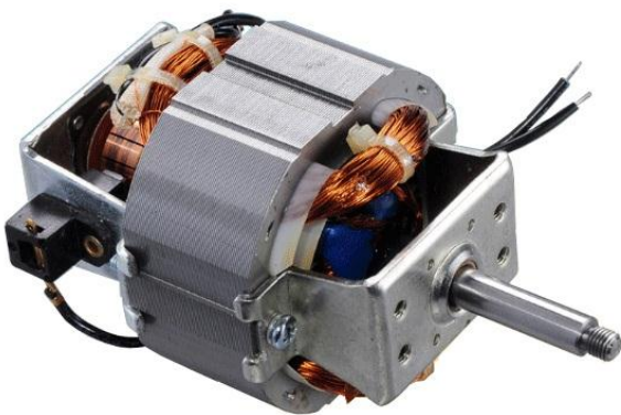
Fig. Electric Motor

An electric motor is an electrical machine that converts electrical energy into mechanical energy. Electric motors are used to produce linear or rotary force (torque).