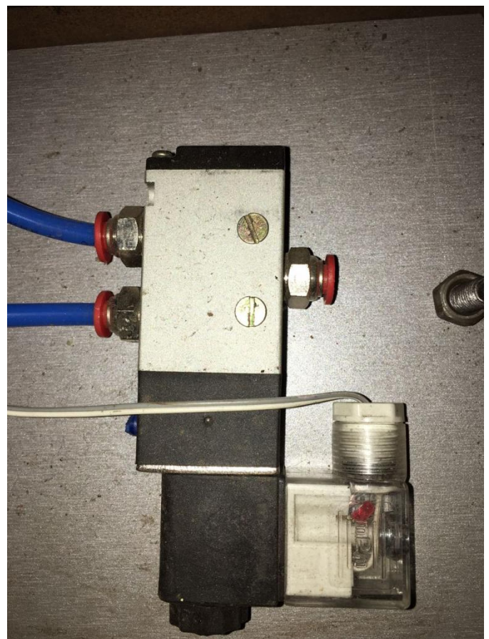
Fig. Solenoid Valve