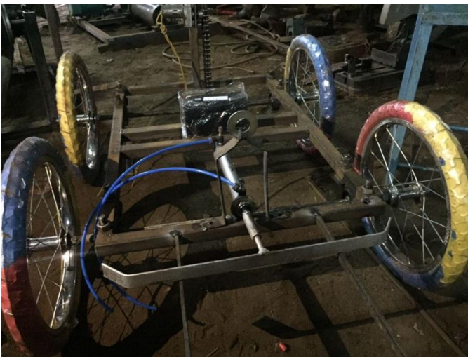
Fig. Final Assembly

All the components are assembled at their proper position. A proper mounting method is used to mount the components. Wiring can be done later.