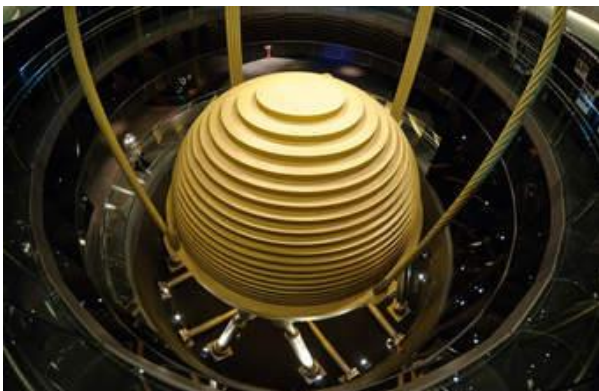
Fig -2: Tuned mass damper