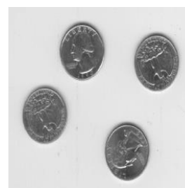
Fig. 4.5 Stego image after adding Speckle Noise