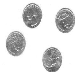
Fig. 4.6 Stego image after adding Poisson Noise