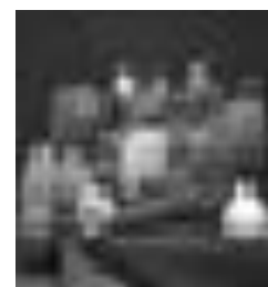
Fig. 4.2 Secret image

The stego image after addition of different noises (like Speckle, Salt and pepper, Gaussian and Poisson) are shown in Fig. 4.3 to Fig. 4.6