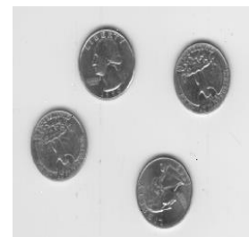
Fig. 4.4 Stego image after adding Salt and Pepper Noise