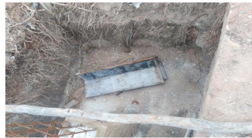
Fig -4.4: Presence of tree roots