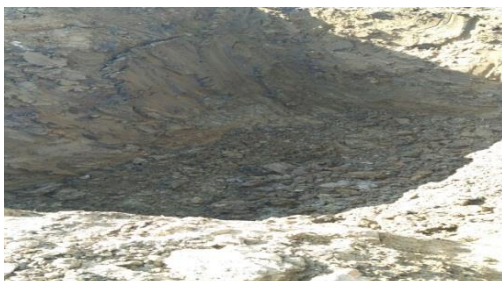
Fig -4.2: Foundation on poor soil (silt/clay)