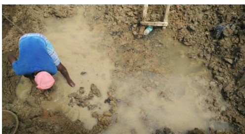
Fig -4.3: Water logging during excavation