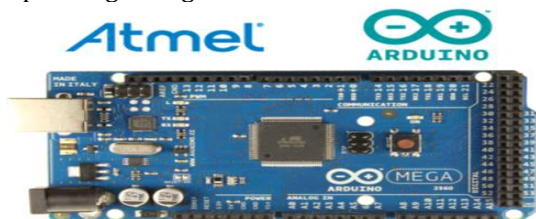
Figure 1: Arduino compiler