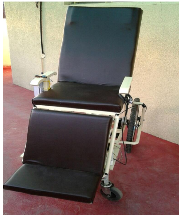
Figure 5: Wheelchair.

pressing it. This in turn generates the signal which makes the gear motor to rotate the gears attached to the motor are also attached to the microcontroller. The linear actuator attached to the back resting support and to the leg support portion which slowly rotates in the clock wise direction and simultaneously the foot part will rise up after reaching the prescribed position it will stop. For converting from stretcher to bed the mechanism is similar but the portion of back will move in anti-clock wise direction and the foot will move down wards to make wheel chair position. This process of conversion can be stopped anywhere if the patient feels that it is the comfortable position. The whole process works only with the help of linear actuator on hinge joint mechanism. A reasonable number of gears are used here in order to increase the gear reduction ratio. Increasing the gear has the advantages that its speed reduces so that the conversion system can be done slowly. It also increases the torque of the shaft so that a heavy load can be easily carried. The wheelchair is operated with the help of accelerometer, which in turn controls the wheelchair with the help of hand gesture. The wheelchair moves front, back, right and left. Due to which disabled and partially paralyzed patient can freely move. [6], [7]