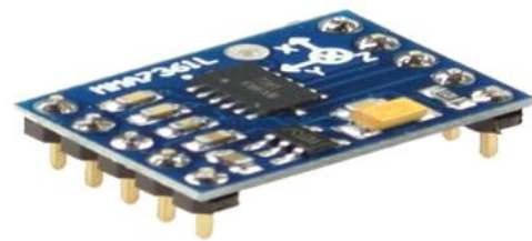
Figure 2: accelerometer.