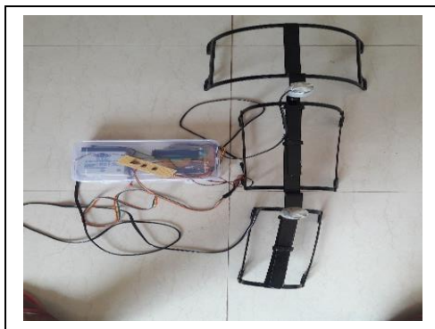
Fig -5: Experimental Setup