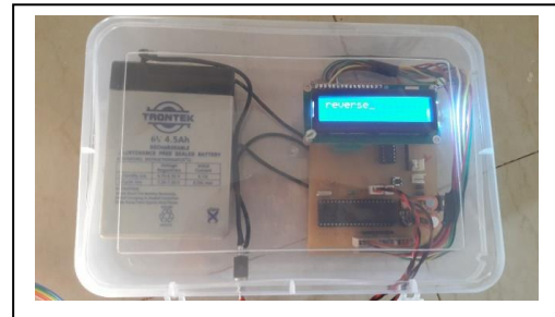
Fig -8: Reverse Condition