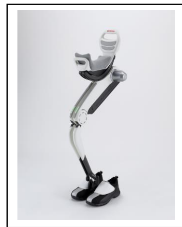
Fig -1: Existing Model

direction motion, second key gives reverse motion and third one gives the automatic mode that is both forward and reverse motion having some amount of delay (30 seconds).