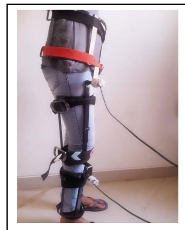
Fig -2: Modified Model

Motor relay driver circuit consist of ULN2003 IC which is used to drive the relay. Relays are used because only low power signal is used to control the circuit. In this project four relays are used to drive two motors that is two relays for each motor. Each relay gives output voltage of 6V and each motor require input voltage of 12V respectively. Here two motors are used one is at hip joint and another is at knee joint. These two motors are DC motors. In DC motor the coil of wire which carries the current generated an electromagnetic field and by