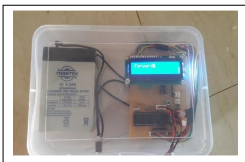
Fig -6: Forward Condition