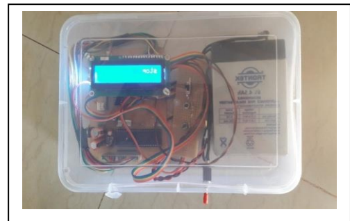
Fig -7: Stop Condition