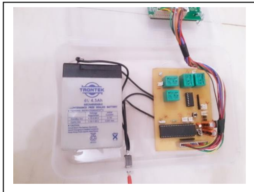
Fig -4: Microcontroller Board