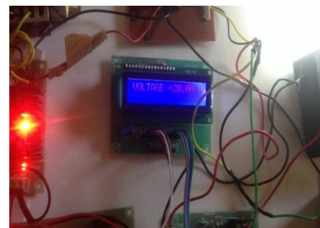
Fig - 3: LCD showing Output of the circuit