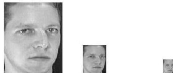
Fig -3 : Output of Gaussian operator