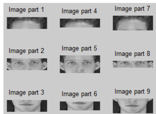
Fig -4 : Horizontal face granules

To fit in with the observations of Campbell horizontal and vertical granules are generated by dividing the face image F into different regions. The second level of granularity provides toughness to variations in inner and outer facial regions. It utilizes the relation between horizontal and vertical granules to address the variations in chin, forehead, ears, and cheeks caused due to plastic surgery procedures. The granules generated by this level is shown in Fig 4 & 5.