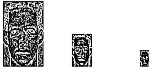
Fig -2 : Output of laplacian operator

filtered images by iteratively convolving each of the constituent images with a 2D Gaussian kernel. Granules generated by Gaussian and Laplacian operators are represented by Fig 3 ad Fig 2 respectively.