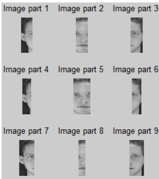
Fig -5 : Vertical face granules