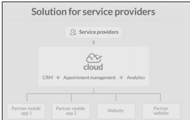
Fig 3:- Solutions For Service Provider

the services personally without interference of the third party companies.