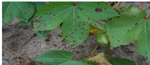
Figure 1. Bacterial blight (angular leaf spot) caused by Xanthomonas campestris pv.malvacearum .

The disease may occur when plants are 45-60 days old. Measuring 0.5 to 6 mm diameter, small, pale to brown, irregular or round spots may appear on the leaves. Several spots coalesce together to form blighted areas. The affected leaves become brittle and fall off. Each spot has a central lesion surrounded by concentric rings Intermittent rains and moderate temperature 25-28°C And high humidity.[2]