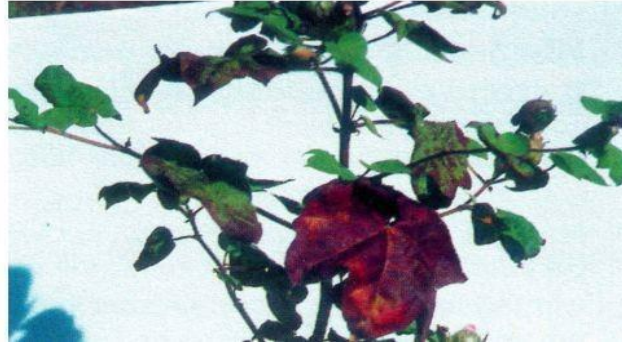
Figure 2- Cotton crop affected by Reddening disease.

In this disease leaves of the affected cotton plants turn yellow or red during all the stages of growth. The red color may also develop as patches in interveinal portion of the leaves. In some cases, the whole leaf is involved. The affected leaves roll down wards, ultimately shed and begin to dry . The affected plant exhibits excessive shedding of the bolls and early fruiting.[3]