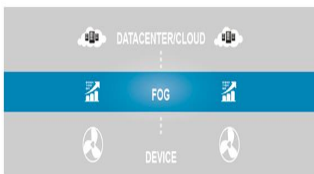
Figure 2.2 Cisco

To illustrate the need for smart dispensation of some kind of data, IDC estimates that the amount of data analyzed on devices that are physically close to the Internet of Things is approaching 40 percent, which supports the urgent need for a different approach to this need.