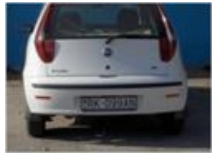
Fig - 2 : (a) Input image in RGB form

The converted grayscale image is shown in the Figure 2(b).