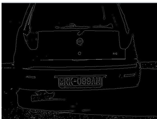
Fig – 4 : Edge Detection using Laplacian Operator

This is the most important step of the VLPR system and determines the overall success of the recognition process. In this approach we have used the Laplacian operator to first detect the edges in the image. The laplacian operator works on the principle of convolution and unlike other edge detectors like Sobel or Prewitt, it uses a second order derivative mask. Thus the Laplacian operator can detect both vertical and horizontal edges at the same time as shown in the figure 4.