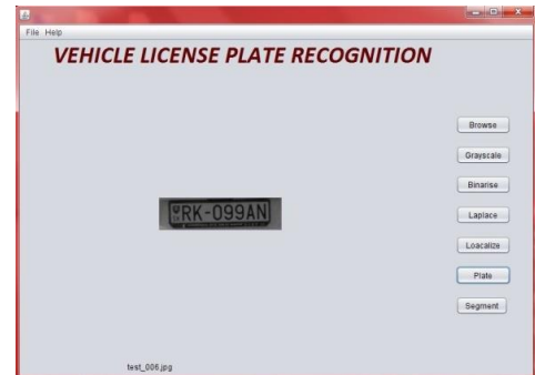
Fig – 5 : Localized License Plate