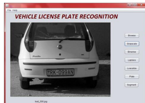
Fig - 2 : (b) Grayscale Image