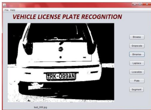
Fig – 3 : Binarized image using Otsu method