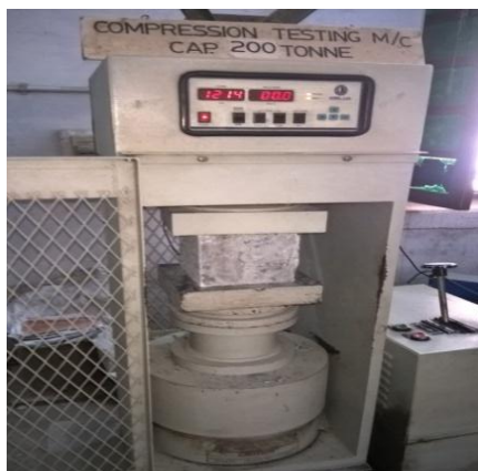
Figure-2: Specimen testing in Compression Testing Machine