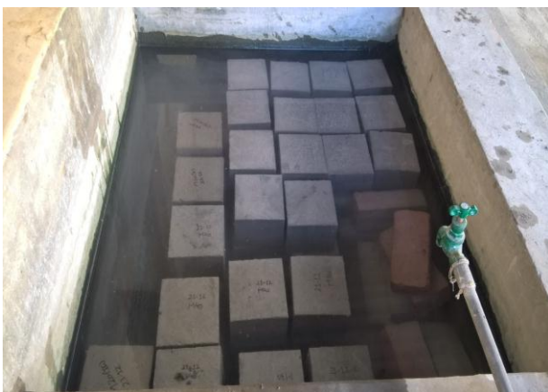
Figure-1: Curing of specimens

The aim of the present study was to study the effect of fly ash on compressive strength of concrete by partial replacement of cement with 0%, 10%, 20% and 30% of fly ash. The concrete mix of M20 grade was prepared as per IS10262:2009 having mix design ratio as 1:1.4:2.96 and w/c ratio of 0.50. To carry out the experimental investigation total 24 cubes of size 150mm x 150mm were casted. 6 cubes were casted to determine the compressive strength of normal concrete with no fly ash. Similarly, each set of 6 cubes were casted to determine the compressive strength for 10%, 20% and 30% replacement of cement with fly ash respectively. From these 6 cubes, 3 cubes were utilized to determine the compressive strength of concrete after 7 days of curing and rest 3 cubes were used to determine the compressive strength of concrete at 28 days. Compression Testing Machine of 2000kN capacity was used to determine the total compressive load taken by concrete at different ages. This ultimate load divided by the cross-sectional area of the cube (150mm x 150mm) yields the compressive strength of concrete.