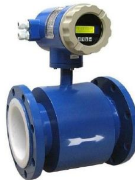
Fig. 3 Flow Transmitter