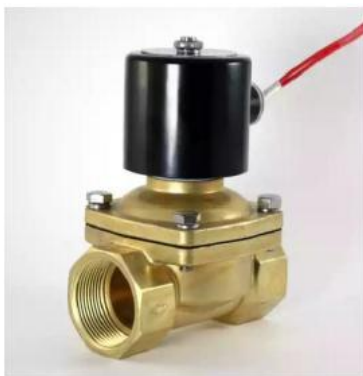
Fig.2 Solenoid valve