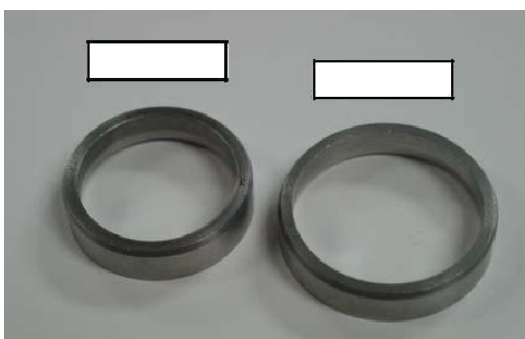
Figure 2: Powder Metal Rings A and B.

In the present investigation, extensive experimental work in machining of powder metal steel was carried out to establish an interrelationship between a major machining performance measure (tool-life) and the cutting parameters (cutting speed and feed). This interrelationship was developed for plunge cutting and boring operations under flood-cooling conditions. This chapter describes the experimental setup and the experiment design used for this investigation. The observations made during the experimentation and the practical problems experienced are also highlighted in this chapter.