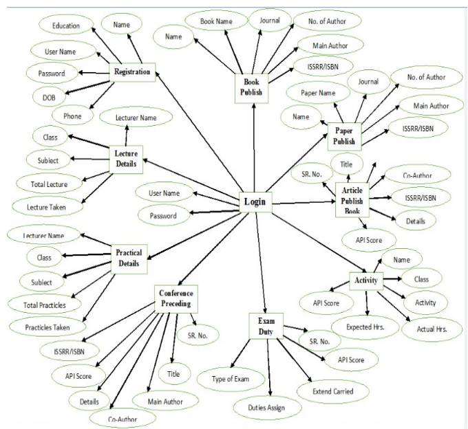
Fig -1: System Skeleton

Structure of data entry modules: A performance appraisal is a systematic and periodic process that assesses an individual Teachers job performance and productivity in relation to certain pre-established criteria and universities objectives.