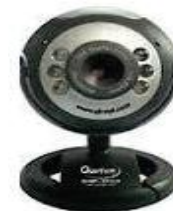
Fig. 2.2: Webcam 6 light Night Vision

The system also consists of USB connected webcam. When there is an unauthorized movement this video camera located in the vehicle starts snapping the images or captures the video of the interior. This pictures or video is sent to the vehicle owner via internet networks as an email attachment. This data can be used for the theft identification. This webcam consist of an inbuilt sensitive microphone and high quality CMOS image sensor with 25 Megapixels of image resolution. In dark 6 lights can be automatically turn on with the help of light sensor which is also includes in this webcam. It has 30 fps frame rate and USB interface of 2.0.