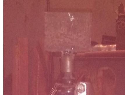
Fig -5: Die Holder

There are specially design to Dies. Circular die and another is Rectangular Die. Circular Die are used for the Bending purpose and Rectangular Die are used for the removing Bend. The Die are made up of Mild Steel.