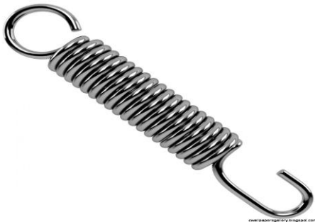
Fig -7: spring

We choose spring for function of which is connected to the ram of hydraulic jack. to bring it down to its original position by using stiffness of spring coil .spring is made of steel and its length is 15 cm.