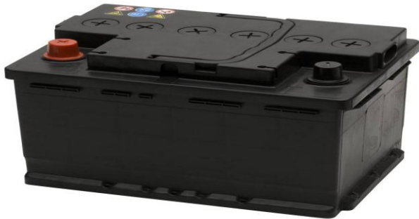
Fig -6: battery

and battery has given supply of electric power. hence battery is used in 12 volt