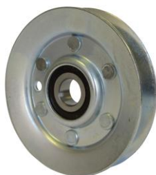
Fig -4: Pulley

Pulley is a wheel on axle or shaft designed to support movement. Top c-channel having holes for changing position pulley as per requirement. pulley diameter is 15 cm.