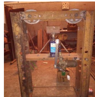
Fig -2: Constructional Diagram