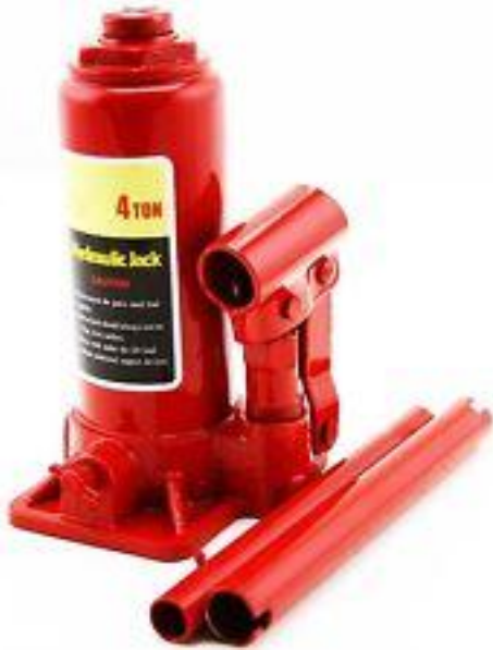
Fig -3: Hydraulic jack

A hydraulic jack is a mechanical device used as a lifting device to lift heavy load or more force. Hydraulic jack get their power from pressurized hydraulic fluid which is typically oil. Hydraulic jack is placed on slider and for better operation the base of the hydraulic jack is welded. Hydraulic jack capacity is 10000 kg.