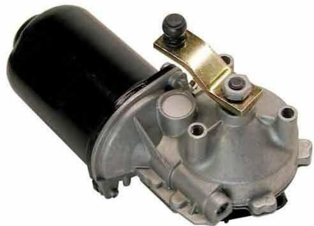
Fig -5: Wiper Motor

A wiper motor is device.it is consist of a metal arm, pivoting at one end. Wiper motor is welded lower side of slider and it gives the uniform linear motion on lever. generally wiper motor used in 150rpm.