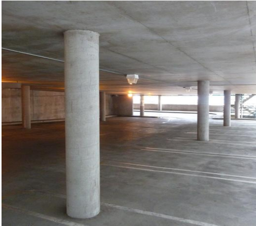
Fig 3 Flat slab construction

The main disadvantages of flat slab systems are; they are not suitable for supporting brittle (masonry) partitions, higher slab thickness, Chance for progressive collapse is more in flat slab due to the punching shear failure, in flat slabs, the middle strip deflection may be critical.