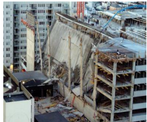
Fig 2 Building collapse due to punching shear in flat slab