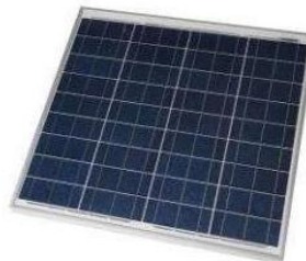
Fig -8: Solar Power Cell