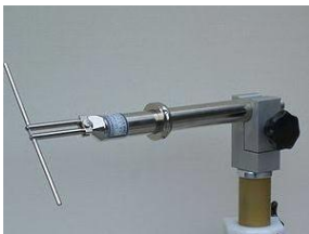
Fig -10: Dipole Antenna