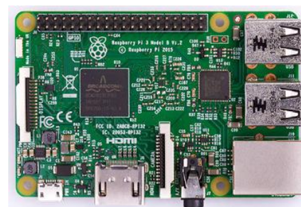
Fig -3: Raspberry Pi 3 B