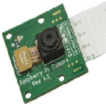
Fig -4: Raspberry Pi 5 MP Camera Board Module