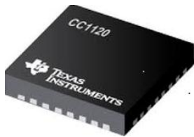
Fig -5: Transceiver IC CC1120