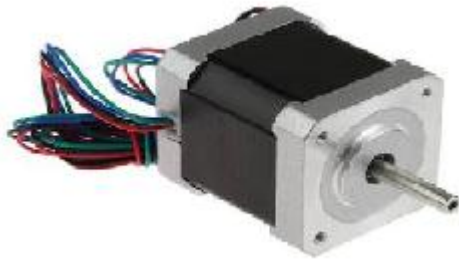
Fig 9 -: Stepper Motor