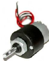
Fig -7: DC Motor- 100 rpm