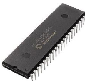
Fig -6: PIC18F4550

PIC18F4550 is an 8-bit microcontroller and is based on 16 bit instruction set architecture. PIC18F4550 consists of 32 KB flash memory, 2 KB Static RAM and 256 Bytes EEPROM. This is a 40 pin microcontroller having 5 input output ports.