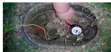
Fig -3: Working Device in Farm Land

By placing the sensor kit into the agriculture land. The sensor will measure the Temperature, pH rate, Water level of that particular soil and sends the information about the abnormalities or low pH rate of the soil. By sensing the soil frequently and suggest the type pesticides to be used .This reduce the farmers workload because the farmer get the intimation about the crop yields and soil .By implementing this smart agriculture it improves the crop yielding and reduce the human workload. The gathered information sends and stored in the cloud environment from there the data will be sending to the registered user to their devices.