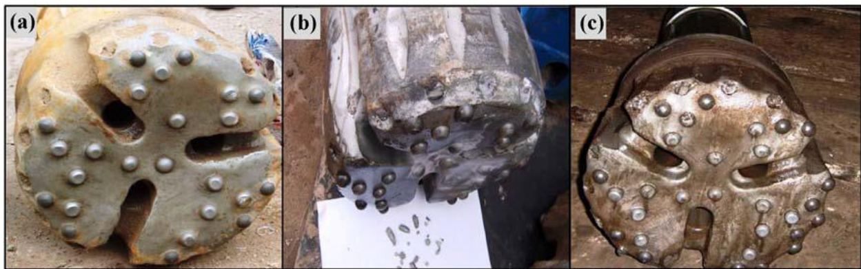
Fig. 3. Failure modes of the hammer bits: (a) tooth loss, (b) tooth fracture, and (c) tooth wear.

In addition, numerous research topics were achieved to improve the performance of the hammer drilling bits. Some of these studies involving strengthening of a bit material and profile optimization. Others involved wear prevention, force response predictions, and in-field process monitoring and dynamic process control. For example, Karakus and Perez improved the performance of diamond hammer drilling bits by estimating the depth of cut, weight on bit and torque on bit (TOB). They simply determined the relationship between the acoustic emission (AE) signals and the drill bit wear using the time spectrum of the acoustic emission. Katiyar et al. recently analyzed the failure mechanisms of the WC/Co tungsten carbide drill bits/blades in rock drilling. The results showed that the WC/Co drill bit exhibited a unique strength at elevated temperature and high mechanical and chemical resistance, but it gradually degraded till it broke at the end of its life.