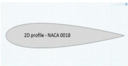
Fig. 1.1- NACA 0018 Airfoil

[As stated by Deepanshu in his Paper], an airfoil profile needed to be selected on which whole study will be based. This is a conceptual study which assumes an Incompressible and isothermal flow. All the simulations are carried out on NACA 0018 (chord length-16 cm). NACA 0018 is a symmetrical airfoil as shown in figure aside. Symmetrical airfoils produce less lift than cambered airfoils but assists more in aerobatics and maneuverability of an aircraft. Figure is 2D NACA 0018 profile made by using X and Y coordinates. Steady State analysis is considered here assuming Turbulent flow. Reynolds number suggests the flow to be fully turbulent. CAD model development is done on CREO 2.0 . Simulations are carried out in ANSYS CFX 3.5 and Comsol 4.2a. As shown in figure below.