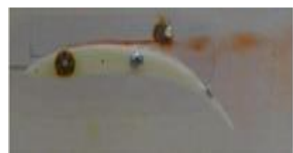
Fig. 1.5- Asymmetric NACA 16611 dimpled Airfoil

[As stated by John Louis Vento of California Polytechnic State University, CA in his Paper], the flow control was tested on two types of airfoils (Chord Length 101.6mm each): a symmetric NACA 0011, intended to represent an airplane in cruise, and a NACA16611, intended to represent an aircraft with flaps extended. Two types of passive systems were employed, a dimple surface augmentation, similar to a golf ball, and a grit system located at 20% chord. The observations during the experiment are as shown below. Figure – 6 Symmetric NACA 0011 Dimpled Airfoil Figure – 7 Asymmetric NACA 16611 Dimpled Airfoil 4.