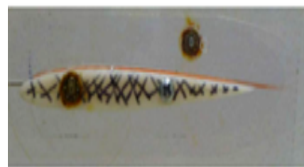
Fig. 1.4- Symmetric NACA 0011 dimpled Airfoil

[As stated by G. Anitha in her Paper], the dimple effect on aircraft wing was carried using NACA 0018 airfoil and was validated with CFD analysis. Dimple shapes of semi sphere, hexagon, cylinder and square are selected for the analysis; airfoil is tested under the inlet velocity of 30 ms -1 and 60 ms -1 at a series of angle of attack AOA (5°, 10°, 15°, 20°, and 25°).