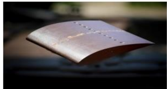
Fig. 1.3- Prototype of dimpled wing

[As stated by Researchers at Khulna University of Engineering & Technology (KUET), Bangladesh in their Paper], developed an experimental prototype of dimpled surface of NACA 4418 airfoil (Chord length 21cm) was used for wind-tunnel testing at Aerodynamics Laboratory, Prototype of the model designed as shown in figure below. Figure 5 – Prototype of dimpled wing.