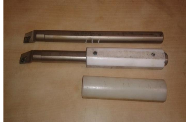
Fig-2 Boring bar with Nylon and Teflon damper

The new damped boring tool is designed using solid works modelling software.