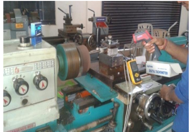
Fig-4 Vibration and temperature measurement

Vibrations are produced by cyclic variation in the dynamic components of the cutting forces. Usually these vibrational motions start as small amplitude vibration responsible for the serrations on the finished surface and chip thickness irregularities. Under some conditions, the cutting process