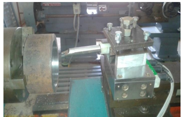
Fig-2 Experimental setup of the passive damper

In this research work a passive damper is used to investigate the performance of boring tool under vibratory conditions. The experiments for boring operation are carried out using boring tool with and without passive damper. The frequency domain analysis is carried out using Vibration meter. The machining parameters are varied by changing spindle speed, feed rate and depth of cut.