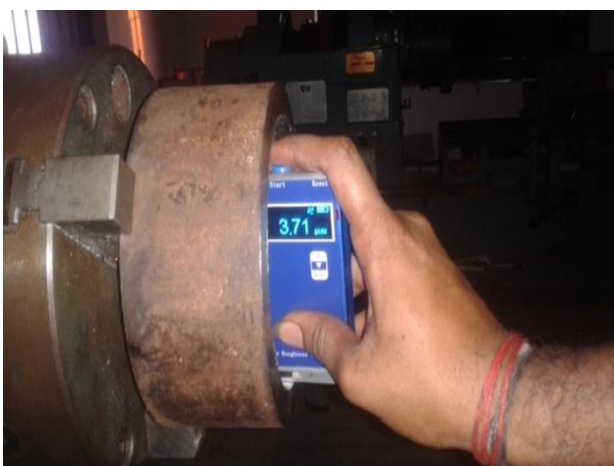
Fig- 3 Surface roughness measurement using surf-tester

Vibrations are produced by cyclic variation in the dynamic components of the cutting forces. Usually these vibrational motions start as small amplitude vibration responsible for the serrations on the finished surface and chip thickness irregularities. Under some conditions, the cutting process