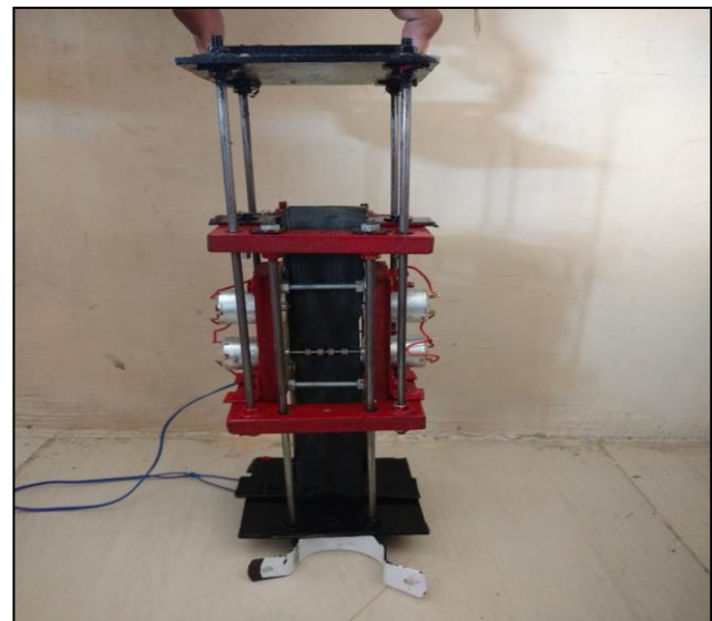
Fig: 4.2.3 Suspension in working condition

Here, when the vehicle suspension works, the linear motion of the suspension creates friction between the pulleys and the belt. Due to this, the pulley starts rotating. The pulleys are mounted on the shaft of the DC motors. As the pulleys get rotated the shaft of the motors also get rotated which generate electricity. The figure shows the implementation of the project and its working therein. As the vehicle passes over an uneven road surface, there is relative motion of the individual wheels. As shown, the linear motion of the wheels causes the suspension to compress and this imparts motion to the belt which is attached to the wheel assembly. This in turn gives rotational motion to the pulley as shown in the highlighted area. The belt then transfers the rotary motion through pulley to the DC motors. The motors generates electricity which is the given to the various auxiliaries of the vehicle. The project assembly thus includes one front wheel, suspension and the designed units attached to it.