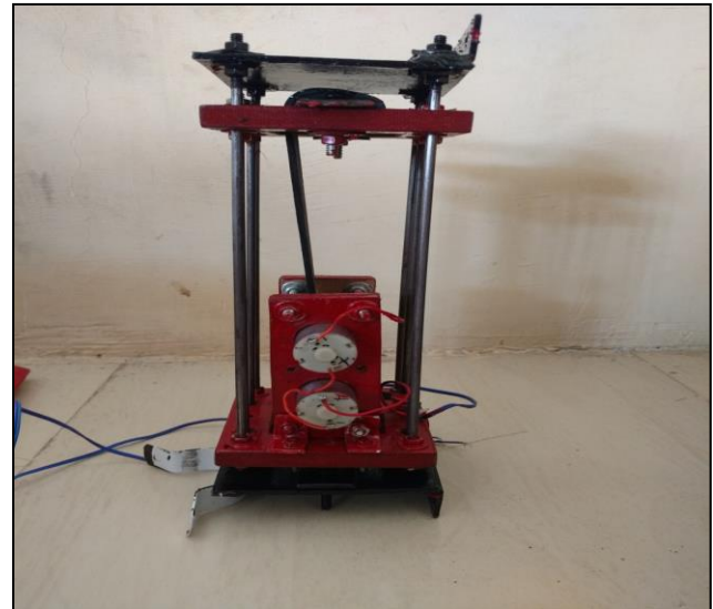
Fig: 4.2.2 Suspension in normal condition