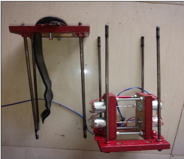
Fig. 4.1.3. Construction of suspension system