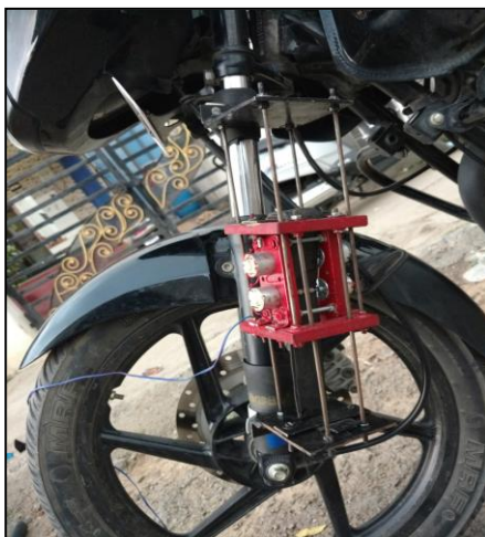
Fig.4.2.1 Suspension system mounted on vehicle