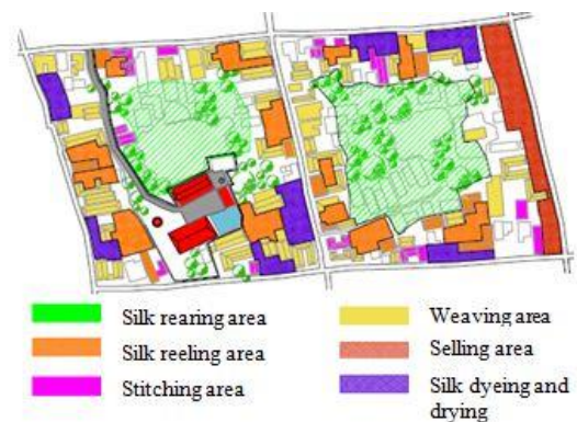
Fig -2: Functioning of a historic cluster

When we zoom in into a cluster, the planning of a traditional cluster becomes very evident. Each cluster functions as an individual unit which combines with other clusters to form a system. With reference to the Figure 2, it is clearly seen that the spaces for every activity related to silk weaving is clearly designated. Linear spaces along the roads are used for drying the silk yarn and the finished fabric. Whereas common open spaces bounded by two or more dwellings are used for silk reeling. The weaving of the silk takes place inside the house and the central space is used for silk rearing in the mulberry plants. The core of the overall area forms the market place where the finished products are sold.