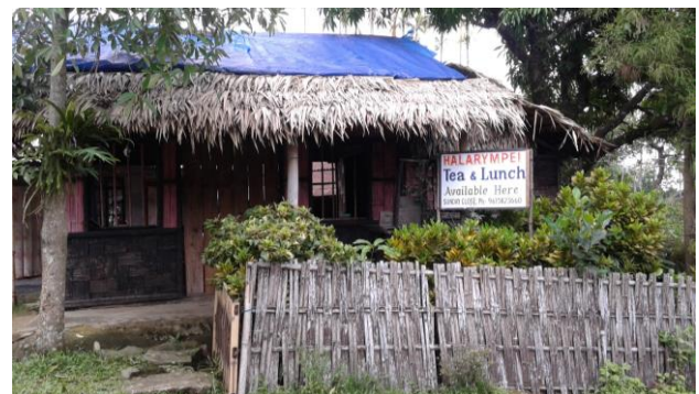
Fig-4: Residence converted to a restaurant, Source : Bikram Aditya Nath

Due to the inflow of a large number of tourists to this settlement, most of the residences have converted the whole or at least part of their house to a restaurant or guesthouse.