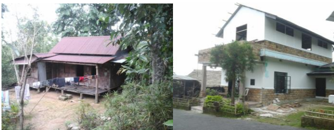
Fig -6: Change in the architectural character of the settlement, Source : Author

Cultural Heritage: Bamboo basket weaving and broomstick making are the two traditional crafts of the settlement which have substantially reduced as people see more profit in dealing with other commercial products. Overall the traditional knowledge system of the use of locally available materials for craft and construction is slowly being lost.