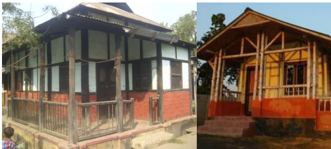
Fig -3: The vernacular architecture and its imitation in concrete

Also, several resorts and guest houses have been constructed which seem like a dire imitation of the rural vernacular architecture of the settlement. Influence of foreign cultures has also brought about changes in the traditional methods of construction. Ikra houses with sloping roofs which were climate responsive and sustainable, have been replaced by concrete and glass, flat roofed houses which are wrongly considered to be a symbol of social status.