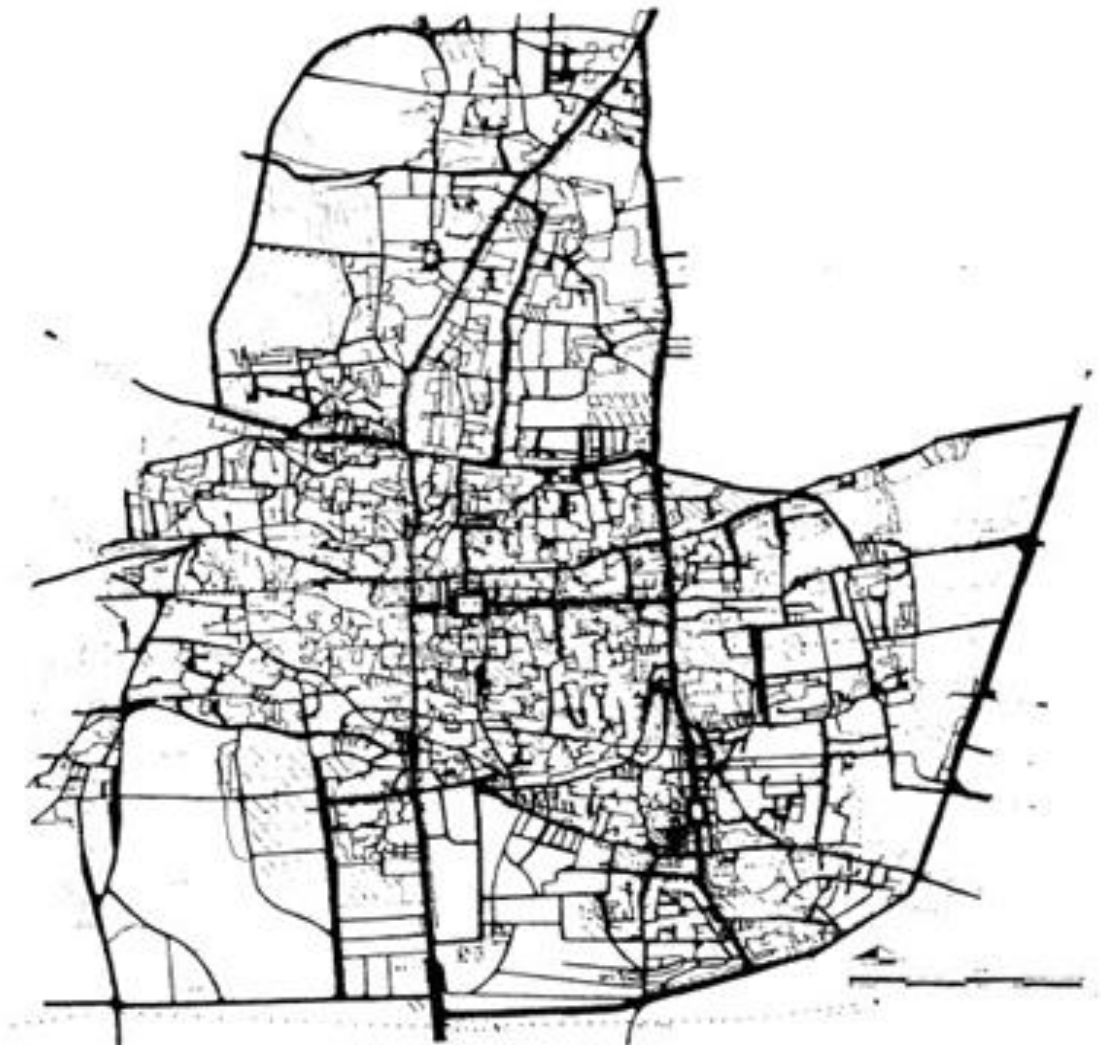
Fig -1: Ujjain Master Plan