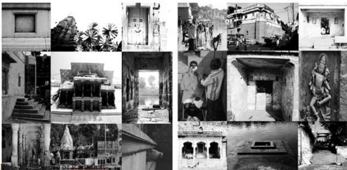
Fig - 3: Pictures of Ramghat