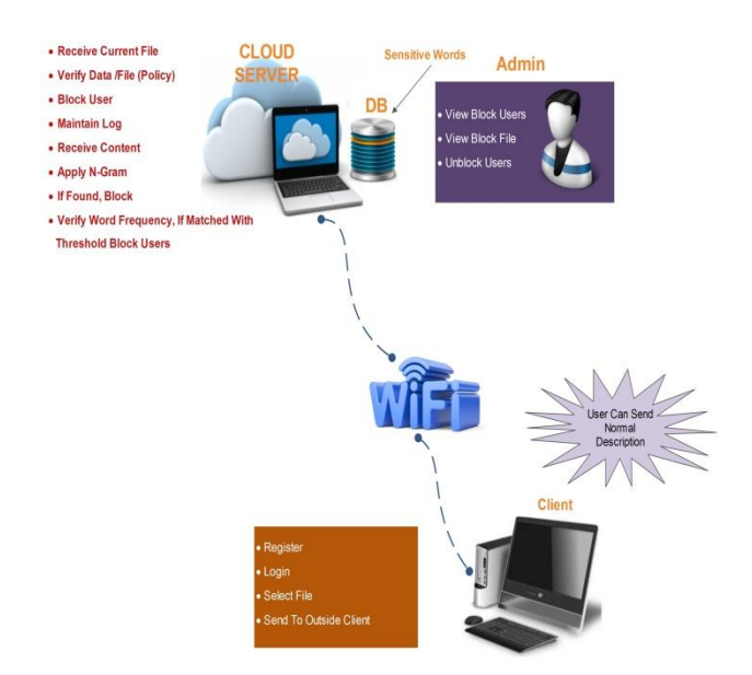
Fig-2: Proposed system scenario

The main objective of the system is to detect the suspicious mail sent by the insider threat. The mail is being sent from client using SOAP (Simple Access Object Protocol). Once it is received on the server side, JAVA API is used to send email to particular receipt.