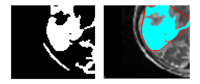
Fig. 3 FCM resulted image

Fuzzy c-means (FCM) it is a method of clustering which allows one piece of data to belong two or more clusters. In this the number of clusters are found by the entropy it is based on the fuzzy rules in this the median value should be the same as near to the pixels, one cluster value and secondly the cluster value should be subtracted the result should come zero and then the rules in this the median value should be the same as near to the pixels .one cluster value and are found then the objective function will be zero and then maximum value get morphed and the result when we get one we will get a color of a tumor which is detected in this we get tumor region and tumor size.