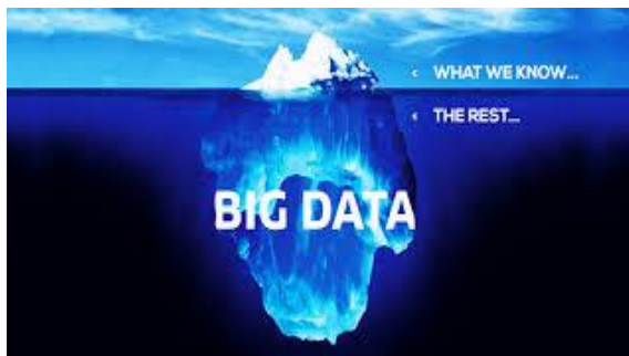
Fig-2: An image of Big data

Volume. Volume of data stored in enterprise repositories have grown from gigabytes to petabytes. Many factors contribute to the increase in data volume like transaction based data stored through the years, unstructured data streaming in from social media etc. Huge amounts of sensor and machine-to-machine data being collected. In the past days, excessive data volume was a storage issue. But with decreasing storage costs, other issues emerge, including how to determine relevance within large data volumes and how to use analytics to create value from relevant data. Volume referred as amount of data.