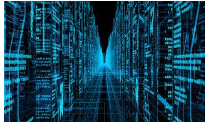
Fig -1: An image of Big data

Every digital process and social media exchange produces Big data. The Systems, sensors and mobile devices transmit. The arrival of big data is from multiple sources at a frightening velocity, volume and variety. We need optimal processing power, analytics capabilities and skills to extract meaningful value from big data. More confident decision making can do with accurate big data. Good decisions lead to greater operational efficiency, cost reduction and reduced risk. Analysis of data sets can find new correlations, to "spot business trends, prevent diseases, and combat crime and so on" [1] . Scientists, business executives, practitioners of media, and advertising and governments alike regularly meet difficulties with large data sets in areas including Internet search, finance and business informatics. Data sets grow in size in part because they are increasingly being gathered by cheap and numerous information-sensing mobile devices, aerial (remote sensing), software logs, cameras, microphones, radio-frequency identification (RFID) readers, and wireless sensor networks [2][3][4] . Big data "size" is a constantly moving target, ranging from a few dozen terabytes to many petabytes of data. (1 petabyte is 1000 terabytes)