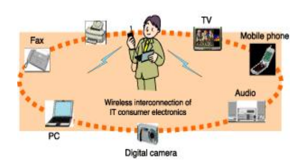
Fig-4: UWB Applications