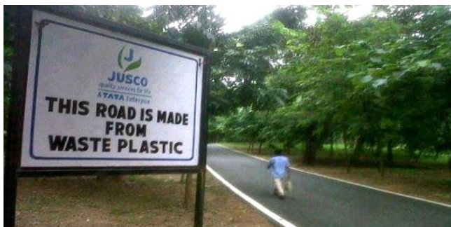
Figure-1: Plastic-bitumen road

Plastic products have become an indispensable part of our daily lives as many objects of daily use are meant from some kind of plastic. The growth in various types of industries together with population growth has resulted in enormous increase in production of various types of waste materials world over. Plastic is everywhere in today's lifestyle. It is used for packaging, protecting, serving and even disposing of all kinds of consumer goods. With the industrial revolution mass production of goods started and plastic seemed to be a cheaper and effective raw material. Use of this non-biodegradable product is growing rapidly and creating problem of disposal of plastic waste. Disposal of plastic waste is particularly plastic bag menace and has become a serious problem especially in urban areas in terms of its misuse, its dumping in the dustbin, clogging of drains; reduce soil fertility and aesthetic problems, etc. The risk to the family health and safety would increase and above all the environmental burden would be manifold. Hence, it is needed that plastic product must be recycled and not end in landfills. Hence, one is the way of disposing tyre waste as crumb rubber into the road for modification of bitumen. Proper addition of such waste in bitumen improves quality, life and minimizes construction cost of road.