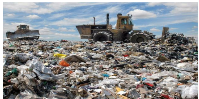
Figure-3: Land filling