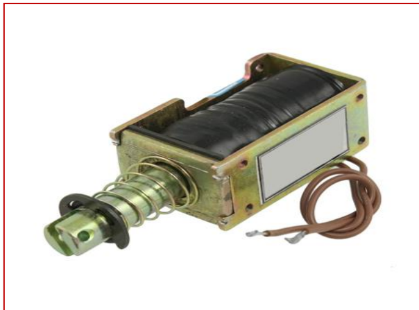
Fig. 5 Electromagnetic Solenoid.

A solenoid is simply a specially designed electromagnet. A solenoid usually consists of a coil and a movable iron core called the armature. When current flows through a wire, a magnetic field is set up around the wire. If coil is of many turns of wire, this magnetic field becomes many times stronger, flowing around the coil and through its center in a doughnut shape. When the coil of the solenoid is energized with current, the core moves to increase the flux linkage by closing the air gap between the cores. The movable core is usually spring-loaded to allow the core to retract when the current is switched off. The force generated is approximately proportional to the square of the current and inversely proportional to the square of the length of the air gap.