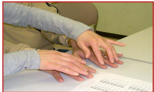
Fig. 1 Finger Braille system

Fig. 1 shows the concept of the Finger Braille system. In this, index finger, middle finger and ring finger of both hands are placed on keys of a Braille typewriter. A sender dots Braille code on the fingers of a receiver like whether he does the type of the Braille typewriter. Then the receiver recognizes the Braille code. Because there are small non-disabled people who are skilled in Finger Braille, blind people communicate only with interpreters. Hence need has been araised to develop independent finger braille interface for blind people.