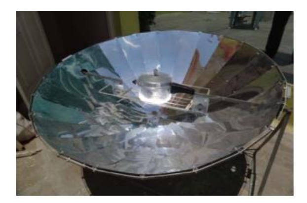
Fig 2 concentrating type of solar cooker[2]

Material for the Body of the Dish Aluminum material was selected because of its lightness, lower cost, ease of fabrication and energy effectiveness in use of material. The reflectivity of the aluminum material is more than 85% the absorber plate material should have high thermal conductivity and compressive strength and good corrosion resistance. Copper is generally preferred because of it's extremely high conductive and resistance to corrosion. Other suitable materials for the absorber plate are aluminum. Material for the body of the dish