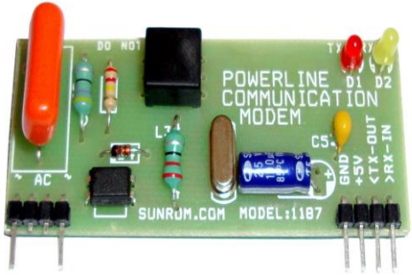
Fig-1 Power line communication modem

Fig-1 shows Power line communication modem Power line modem is useful to send and receive serial data over existing AC mains power lines of the building. It has high immunity to electrical noise persistence in the power line and built in error checking so it never gives out corrupt data. The modem is in form of a ready to use circuit module, which is capable of providing 9600 baud rate low rate bidirectional data communication. Due to its small size it can be integrated into and become part of the user's power line data communication system.