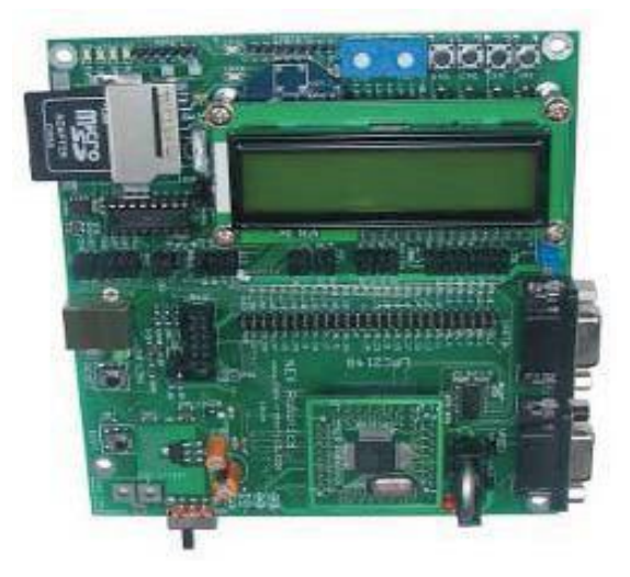
Fig-A LPC2148 program development The LPC2148 microcontroller are based on 32/64 nit ARM7TDMIS whit real time emulation. It is a powerful development platform based on LPC2148 ARM7TDMI microcontroller with 512K on chip memory . this board is powered by usb port and does not need external power supply. It is ideal for developing embedded application involving high speed wireless communication , usb based data logging, real time data monitoring and control. One or two 10-bit ADCs provided.

B) Relay And Relay driver- A high power relay is a important part of this system. It provides the useful functionality of switching the power ON/OFF to the user based on the signal send to it from the controller Corresponding to the status of bill payment. A relay is an electrically controllable switch widely used in Industrial controls, automobiles and appliances. The relay allows the isolation of two separate sections of a system with two different voltage sources i.e., a small amount of voltage/current on one side can handle a large amount of voltage/current on the other side but there is no chance that these two voltages mix up. When current flows through the relay coil, a magnetic field are created around the collie., the coil is energized.