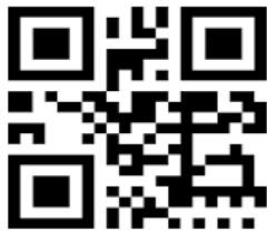
Fig -2.1.4.1: QR Code

After going through various steps the user's details and documents will be verified and authenticated by the admin. If the admin approves the user details and documents the generation of bus pass will take place automatically and pdf with QR code of bus pass will be mailed to the registered user.