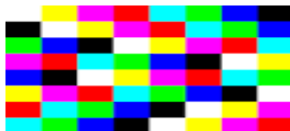
Fig2. Representation of output

Fig 2. Shows the output that is obtained after the encryption process.