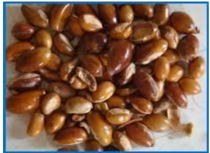
Milletia Pinnata curcas seed