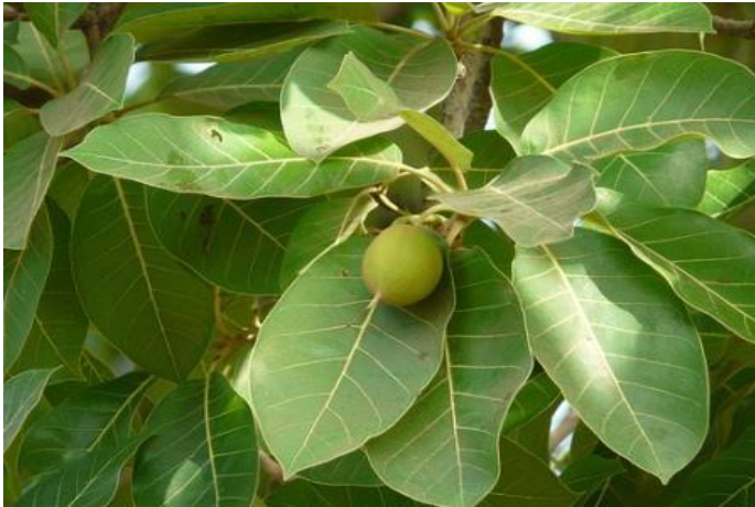
Millettia Pinnata curcas plant